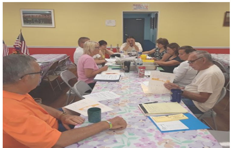
Planning committee for the Johnstown SVDP soup kitchen finalizing plans for the annual Duck Race on Sunday, August 5.